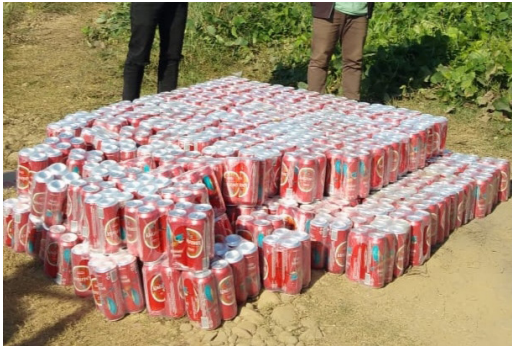
An alert team of the Naga Army personnel on duty at the Council Headquarters (CHq) Hebron seized a huge quantity of beer bottles from two individuals on the 20 th November, 2021. The seized items were destroyed in the presence of the NSCN authorities.