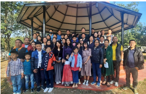
Council of Nagalim Churches (CNC) Staff Family Get-Together on the 15 th December, 2021