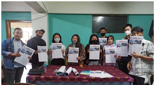
Young Naga students with a copy each of Nagalim Voice November, 2021.

The National Socialist Women's Organization of Nagalim (NSWON) conducted a One Day Life Skill Training on Basket Making and Shoe Making at the NSWON Head Office, CHq Hebron on the 20 th November, 2021 where sixty (60) members (wives of the national workers' wives living in and around the Camp Hebron participated in the training. The training aimed to enhance creativity and uplift their livelihood.